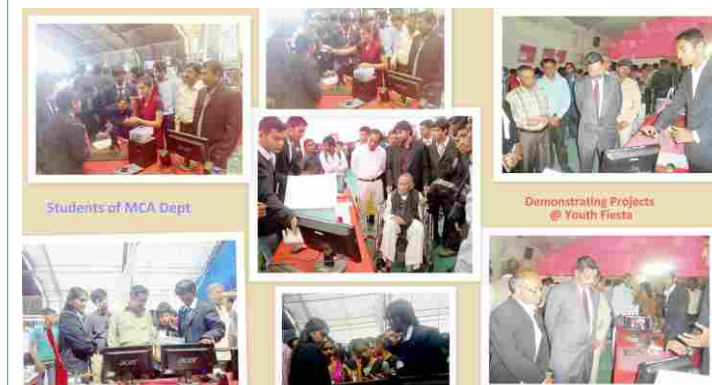
Students of MCA Dept

MCA Department has been actively participating in Youth Fiesta, which is every year organized by B. H. Gardi College of Engg. & Technology. Students develop various projects of Science and Technology and demonstrate the projects to people visiting at Youth Fiesta.