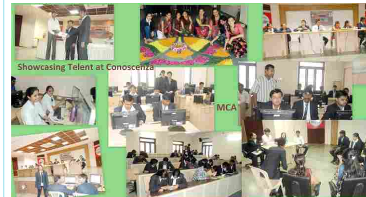
Showcasing Talent at Conoscenza

The Department of MCA has organized a Technical Event "Conoscenza". Under this event many competitions were held like Hackathon, C/C++ programming, Paper presentation, Project competition, Group Discussion, Quiz competition, Fastest finger first etc. The main objective is to provide the platform to the students to showcase their technical skills with a competitive spirit.