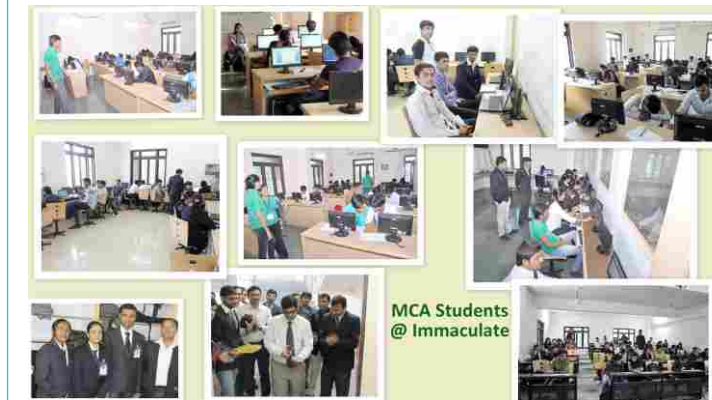
MCA Students @ Immaculate

Every year Gardi Vidyapith organizes Immaculate, a National level technical symposium, which gives a platform to students to present their technical skills in various technical competitions. MCA Department has actively participated in Immaculate.