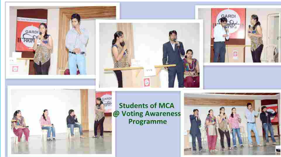
Students of MCA @ Voting Awareness Programme