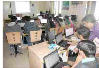
LaTeX workshop for PG students on 20th February, 2014.

To enhance different technical skills like document preparation system for high-quality type setting, Computer Science and Engineering and Information Technology Department of B. H. Gardi College of Engineering and Technology organized one day LaTeX workshop for PG students on 20th February, 2014.